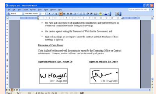
Diagram 1 shows a signed Word document. The signatures are shown along with the date and time of signing. If required, the reason for signing can also be shown in this box.

Financial, Insurance, Legal.... anywhere signatures are required!